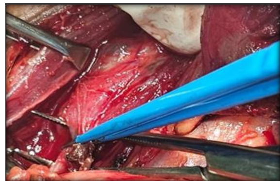
Figure 2: Showing use of bipolar cautery in achieving hemostasis of vascular pedicle.